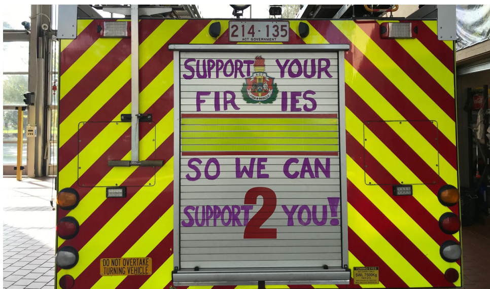
Image: Ainslie fire station pumper during the 2019 bargaining dispute

This question forms the subject matter of the next Report.